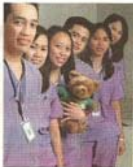
The IntelliCare staff are ready to serve to meet the patient's various needs.

Today, HMOs like IntelliCare are essential partners of the common Filipino to obtain quality medical care. They provide everyone access to the best doctors, in the best hospitals at the most efficient price. More importantly, they allow everyone the exercise of their inherent right to proper healthcare. As more and more Filipinos join HMOs like, IntelliCare, getting well is now becoming more affordable.